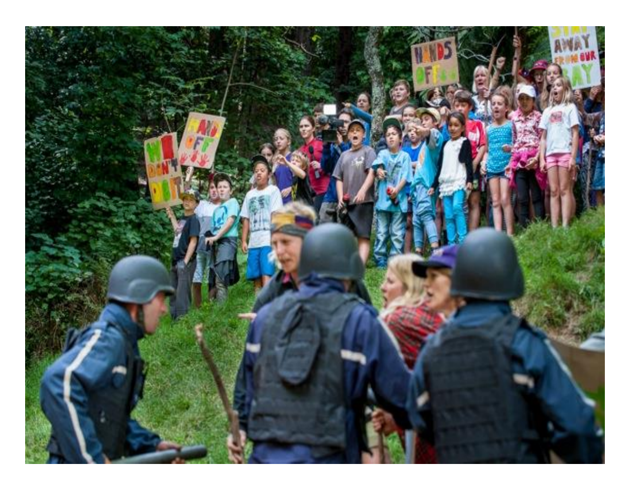
The Z-Nail gang A film about community, made by community.

The feature film "The Z-Nail Gang" which was inspired by a community in the Coromandel recently won Trustpower Supreme Community Award for its far-reaching impacts into the community of the Western Bay of Plenty.