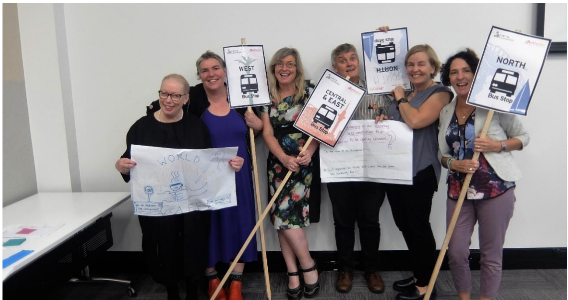
IC Team at Activate 2017