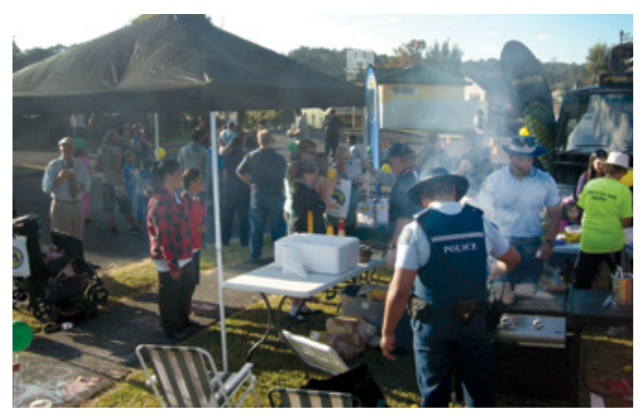
Neighbourhood policing initiatives are currently connecting residents through street barbeques in many New Zealand communities.

When getting started, it's important to think about the kind of approach that will work best for your street, or the street you're working with. Noting what else may be going on already is important, as is knowing the general age of residents, ethnic mix, life experience, and pre-existing relationships. These aspects all impact on the kinds of engagement processes that will likely work best. If you're a new face, taking someone with