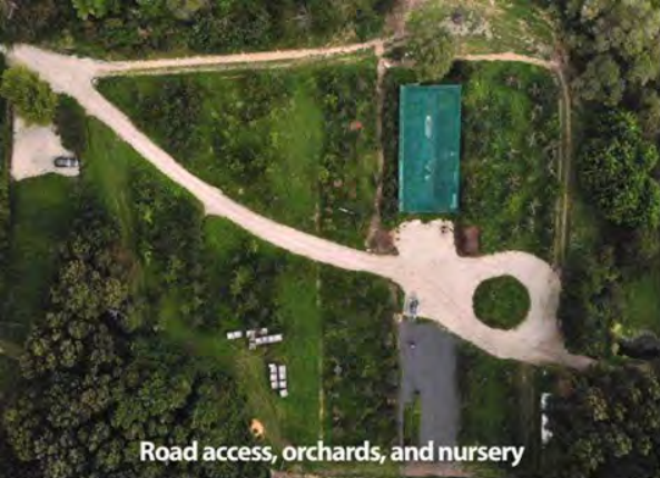
Road access, orchards, and nursery