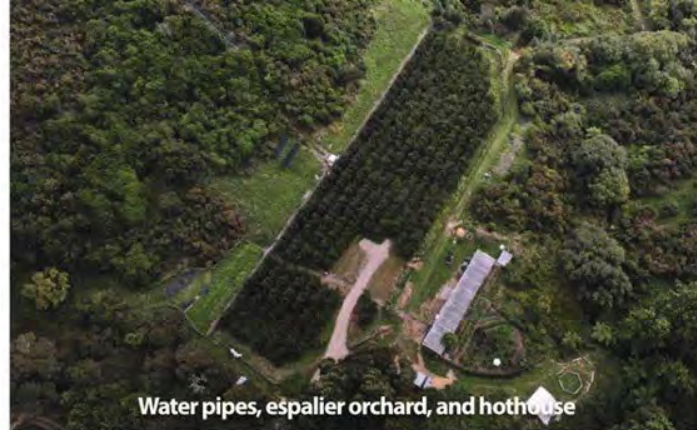
Water pipes, espalier orchard, and hothouse